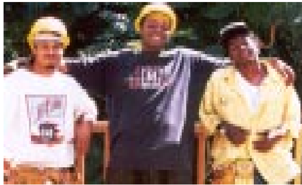
Students at YouthBuild Construction site.

Great efforts have been made to develop a math curriculum that uses relevant examples such as construction, budgeting, and finance problems to reinforce math skills. The reading and writing curriculum focuses on personal growth, cultural history, and community issues; the vocational electives encourage students to push themselves and broaden their skills base.